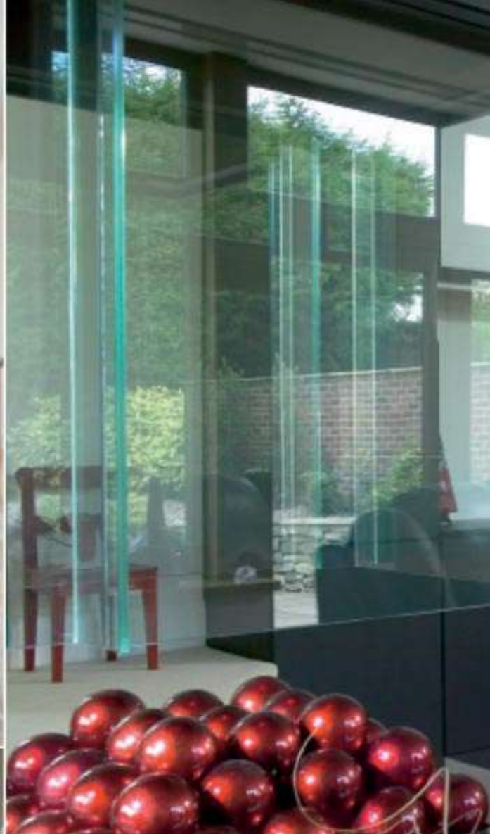
Left: Light and space are key features of the bedrooms, which are simply furnished to allow the high ceilings and large windows to speak for themselves