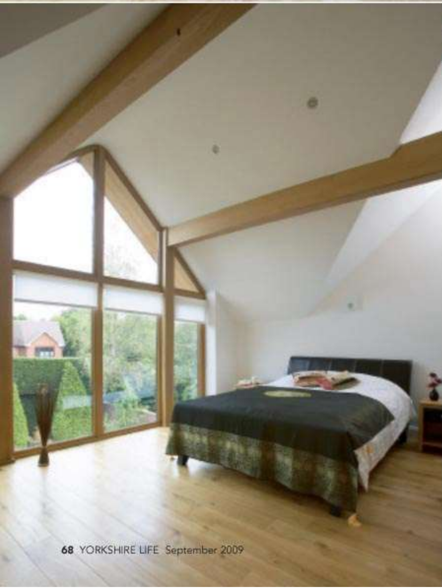
Above: Bill wanted the house to be high tech with a drop-down screen for TV and computer use. An HD In-Focus projector beams the TV onto a 2.3m cinema screen which drops down from the ceiling

'Some of these things are still packed away in boxes, but we couldn't bear to throw them out,' said Liz. 'We had a very clear idea of the way the new house would look and our Eighties style furnishings just wouldn't have worked in the new red and black scheme.'