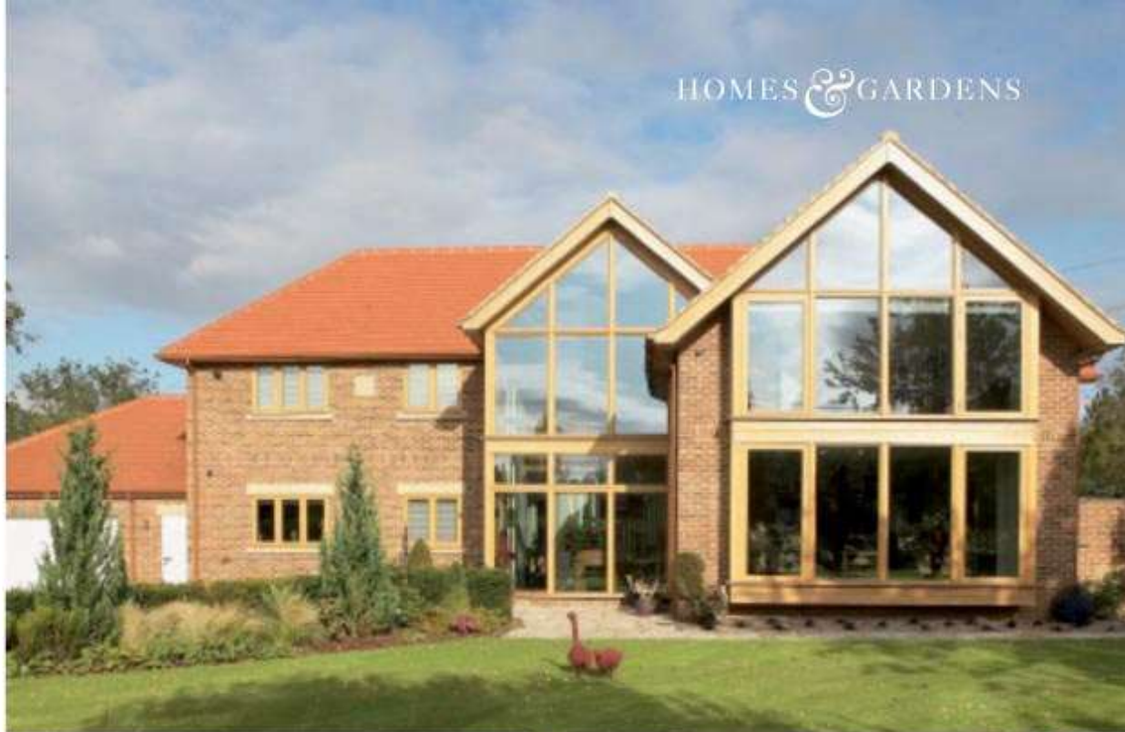
Above: The striking timber-frame house in Claxton, near York, was designed to include eco-principles Right: Liz and Bill can see across the village green and down the main street from their first floor sitting room

Struggling to squeeze their growing family round the table at meal times, Liz and Bill Heath decided it was time to create a bigger dining room. Better still, a bigger house.