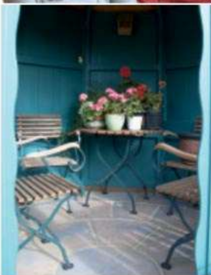
The garden has been redesigned by Sally Tierney of Garden Creations